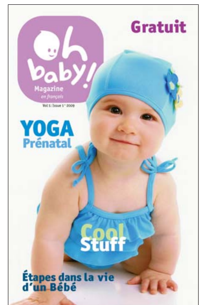
Our Premier Issue, Summer 2009